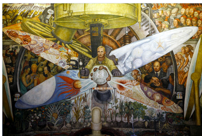
Diego Rivera - "El Hombre al Cruce" - at Palacio de Bellas Artes, Mexico City

If it is bad to be disillusioned, it must be good to be illusioned, right? The name, of course, is intentionally provocative. Gently but unapologetically critical of how institutions have been doing community development and poverty reduction work, it is founded on the